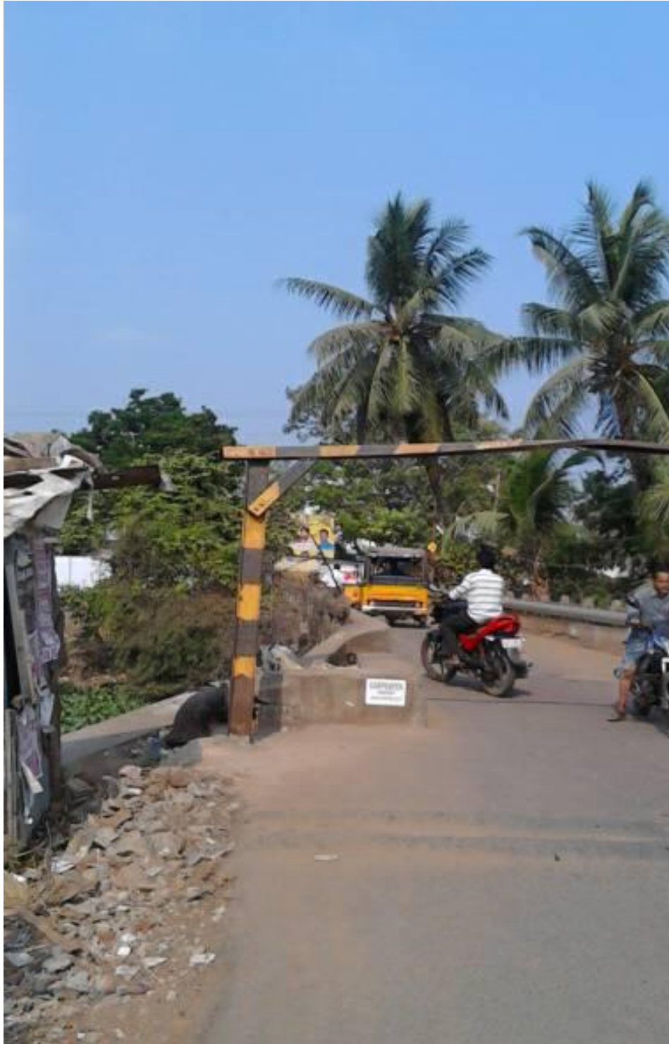
Plate 1: Proposed bridge site location

The broad scope of work under the bid “ Construction of Two Lane Road Bridge at Pratap Nagar, Kakinada ” under Kakinada Smart City Proposal Implementation shall include development and construction as per the Bill of Quantities given in the Volume I/II – Annexure I of the Bid Document and Specifications, Engineering Standards and Tender Drawings for Road Bridge given in this section.